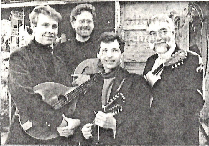
Aldiviva Quartet will play Baroque and classical music today at Red Butte Garden, at mouth of Red Butte Canyon.